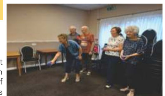
Here is an action photo of some of the members who have embraced this new activity and they would love for you to come and join them.

Points are accumulated over the course of a match to find a winner. The sport is played indoors on a 12.5m by 6m court, usually in a hall but any suitable flat playing area can be used. You just need to be able to stand and bowl a ball.