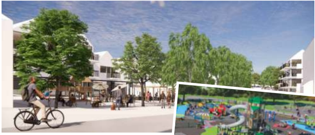
The New Eckington Town Centre and possible new play area (artists impressions)